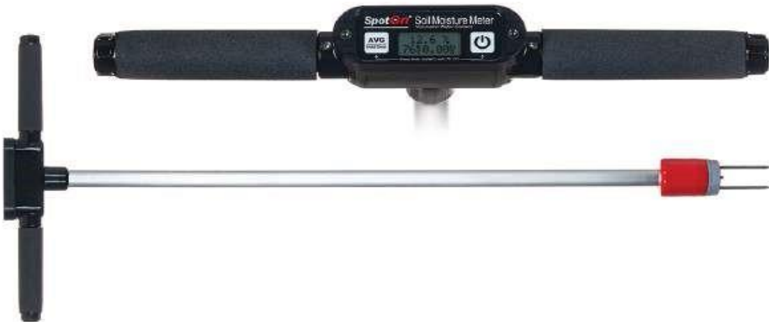
Spot On Soil VWC Moisture